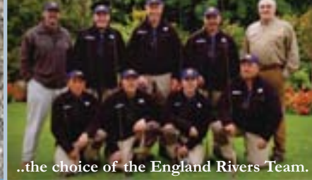
...the choice of the England Rivers Team.

Snowbee® have an established pedigree in wader production spanning nearly 30 years, making us one of the longest running and most prestigious manufacturers today, with a huge leap forward in both quality materials and design in the last couple of years.