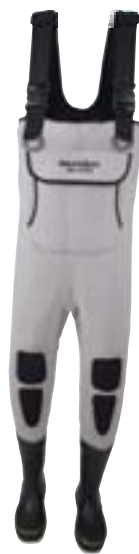
Granite CR Neoprenes from £79