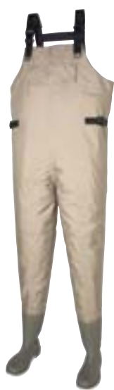
Classic Breathables from £119