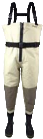
XS Pro Zip-front breathables from £189