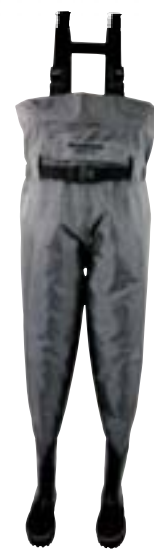
Granite Nylon - as tough as they come! from £65

Affordable quality... ...designed with purpose.